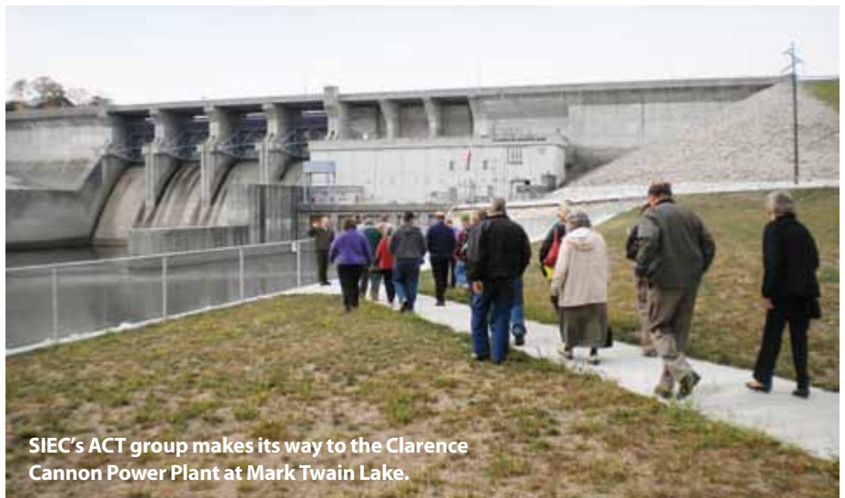
SIEC's ACT group makes its way to the Clarence Cannon Power Plant at Mark Twain Lake.