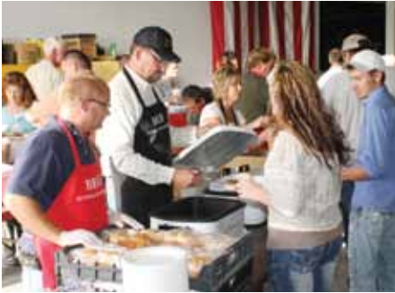
Members enjoy a meal served by Davis County Cattlemen's Association.