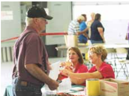
Members received rebate information and their Co-op Connections Cards, so they could start saving money right away at participating pharmacies and businesses.