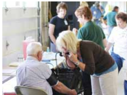
SIEC members could get flu shots and have their blood pressures checked, thanks to the staff members from Davis County Home Health.