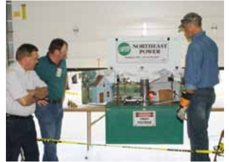
SIEC linemen talked with members about the dangers of downed power lines.