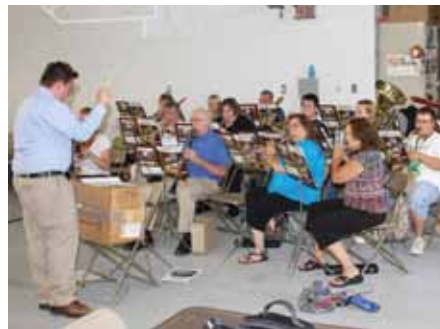
Music played by the Davis County Community Band accompanied the slide show showing the cooperative's highlights from the past year.